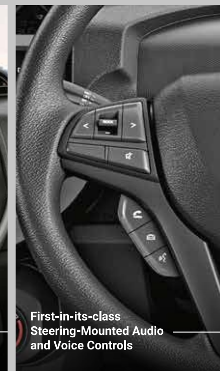
First-in-its-class Steering-Mounted Audio and Voice Controls