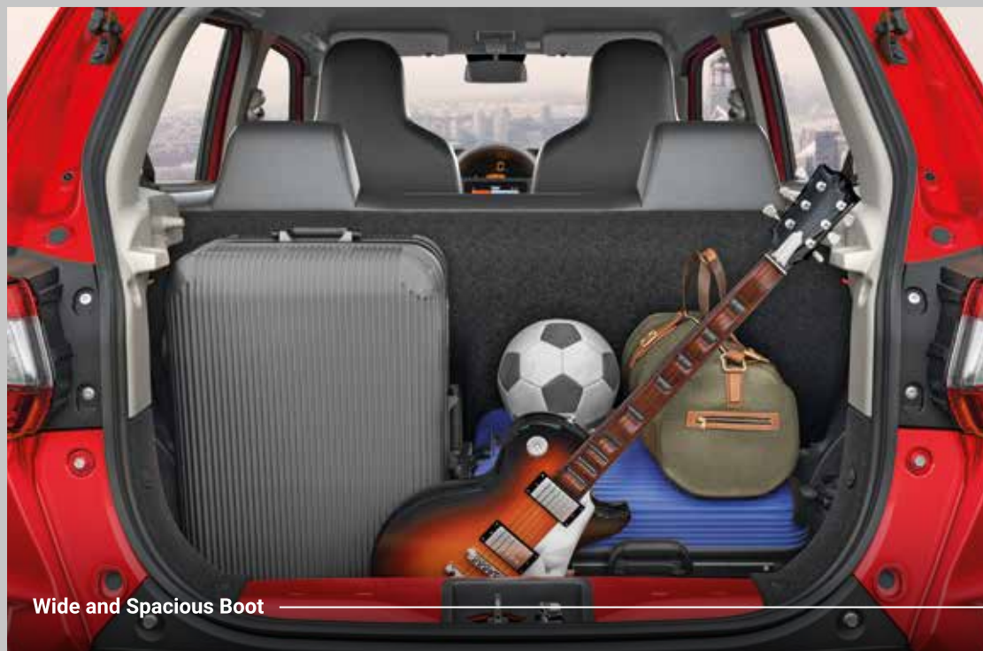
Wide and Spacious Boot

Open the doors and the S-PRESSO simply invites you to a world of never-ending excitement. All thanks to the commanding high-view seating that lets you scope the fun around you. Plus, its Dynamic Center Console, first-in-its-class Steering-Mounted Audio and Voice Controls and swanky colour accents make you feel alive, even before you drive out.