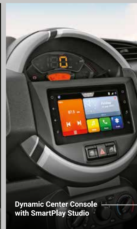
Dynamic Center Console with SmartPlay Studio