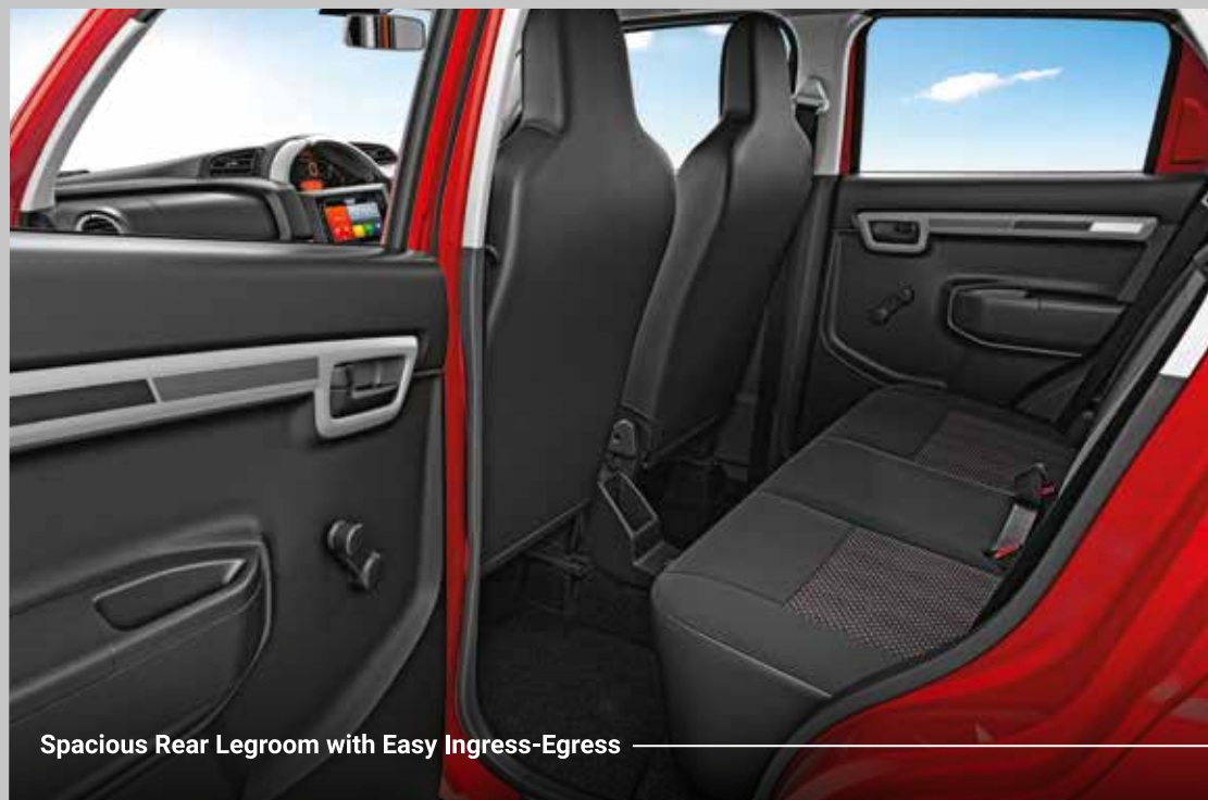
Spacious Rear Legroom with Easy Ingress-Egress