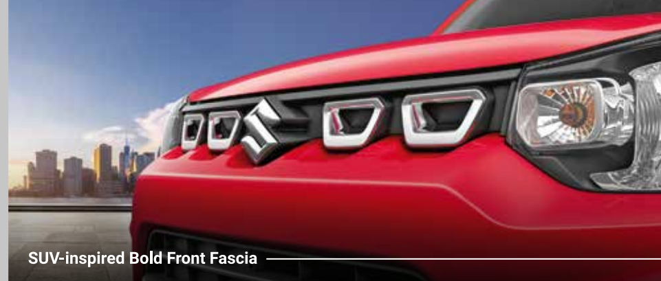
SUV-inspired Bold Front Fascia

How do you turn the everyday into something more? Simple. By adding passion, enthusiasm and little touches of surprise. That's exactly what you'll find in the Maruti Suzuki S-PRESSO . Slide in behind the wheel and accelerate through a journey of spirited living. Excitement, after all, is not a feeling, but an experience. So, are you made for more?