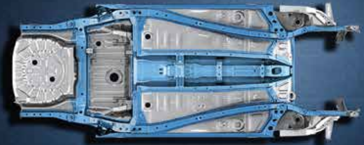
Strong HEARTECT Platform

25.30* km/l (For AGS) INCREDIBLE FUEL EFFICIENCY