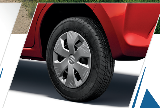
145/80 R13 TYRES WITH HONEYCOMB WHEEL COVERS