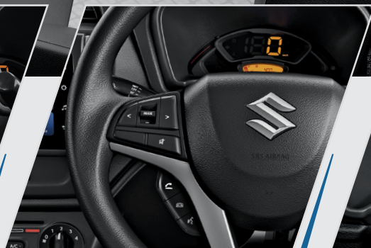
STEERING MOUNTED AUDIO AND VOICE CONTROL