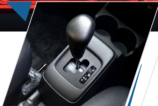
AUTO GEAR SHIFT TECHNOLOGY