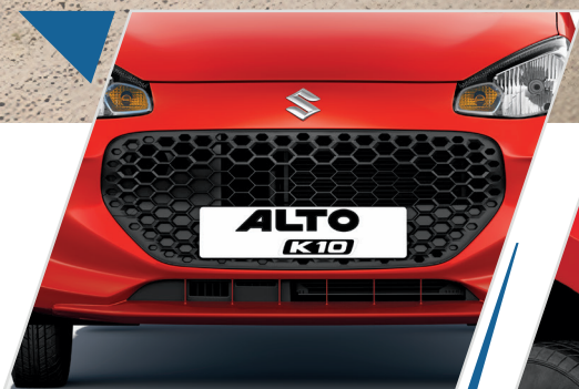
YOUTHFUL CONTEMPORARY DESIGN WITH HONEYCOMB GRILLE

Now experience the feeling of accomplishment with a special companion, the Alto K10. It offers remarkable looks with a great combo of style and modernity.