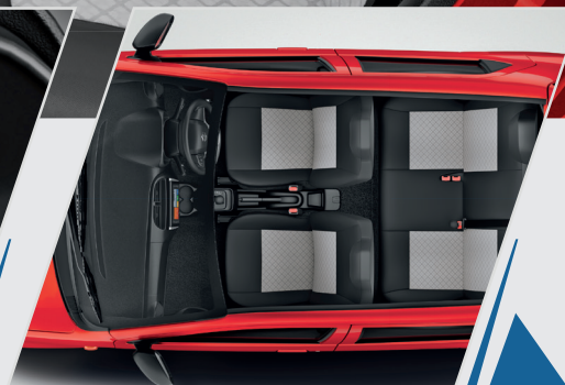
1 st IN SEGMENT 4 SPEAKERS