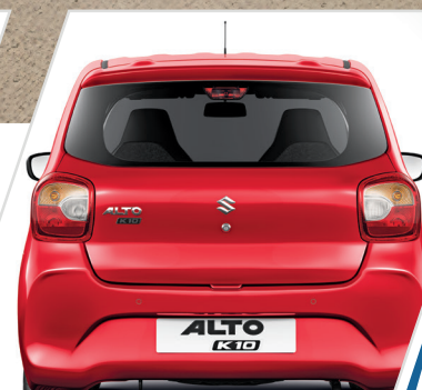
TRENDY REAR COMBINATION LAMPS