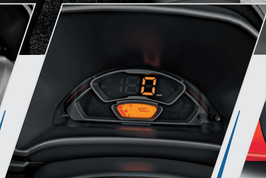
SPEEDOMETER WITH EXCITING DIGITAL SPEED DISPLAY