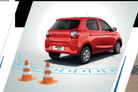
REVERSE PARKING SENSORS