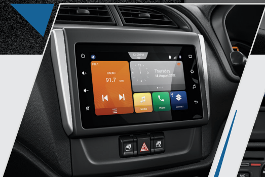
SMARTPLAY STUDIO WITH SMARTPHONE NAVIGATION

Alto K10 comes with modern interiors with updated technology, a perfect blend of comfort and practicality.