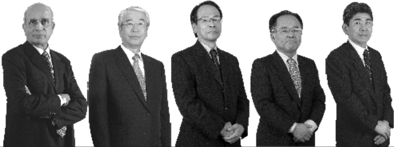
Mr. R. C. Bhargava Chairman