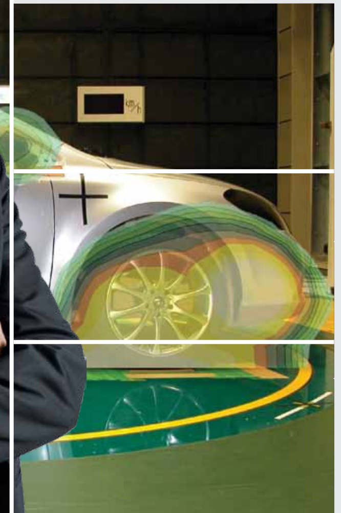
In the background is a clay model during the initial phases of model development.